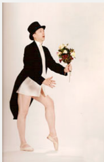
A scene from Nut/Cracked.